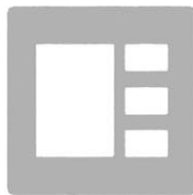
507 (5X7 & 3X2)