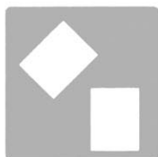
527 (5X4 & 4X5)