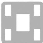
520 (4X5 & 2X3)