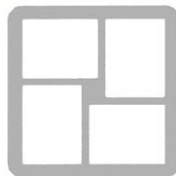
46 (4X6 & 6X4)