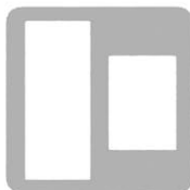
544 (5X10 & 5X7)