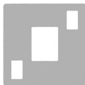
519 (4X5 & 2X3)