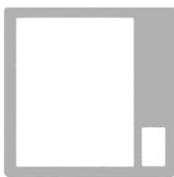
502 (8X10 & 2X3)