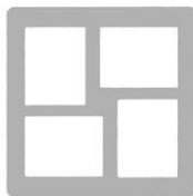
45-54 (4X5 & 5X4)