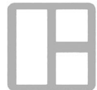
545 (5X10 & 5X5)