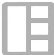
547 (5X10 & 2X3)