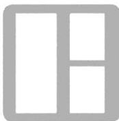
546 (5X10 & 4X5)