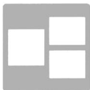
513 (5X5 & 5X4)